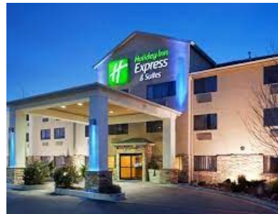
Holiday Inn Spring 2021 Opening

COVID disclaimer: During the year of the pandemic, 2020, the Fountain Urban Renewal Authority initiatives were curtailed due to an abundance of caution regarding revenues performance and attentive monitoring of its four designated urban renewal areas. As a COVID Recovery ensues in 2021, these cautionary measures will continue along with a focused attention on inhibiting blight due to commercial vacancy byproduct.