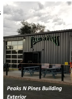
Peaks N Pines Building Exterior