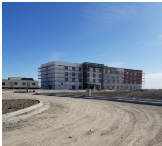
Holiday Inn Under Construction

Holiday Inn Express completed construction in Summer 2021 and opened during COVID.